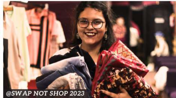
@SWAP NOT SHOP 2023