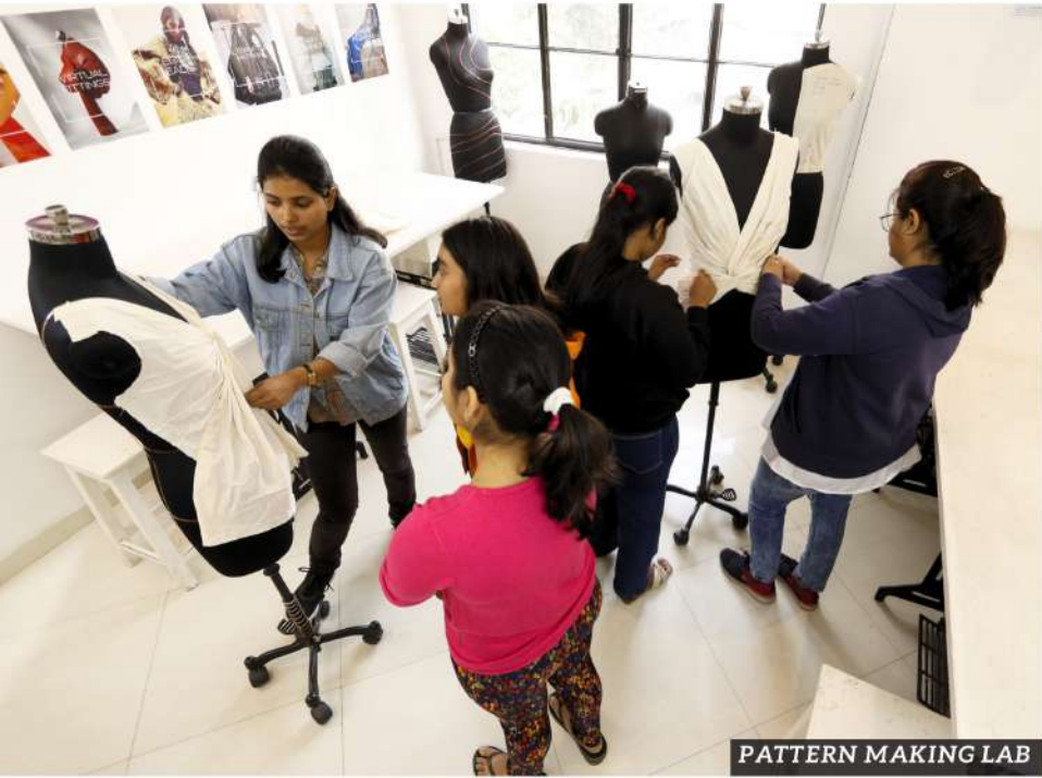
PATTERN MAKING LAB