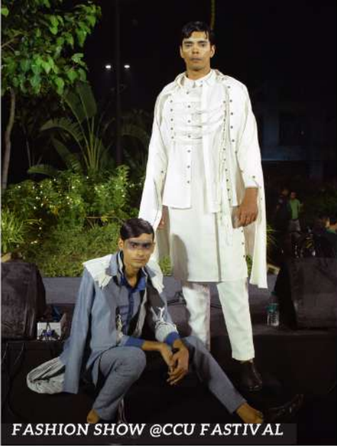
FASHION SHOW @CCU FESTIVAL