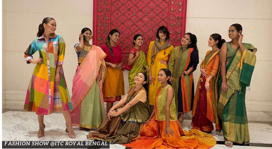
FASHION SHOW @ITC ROYAL BENGAL