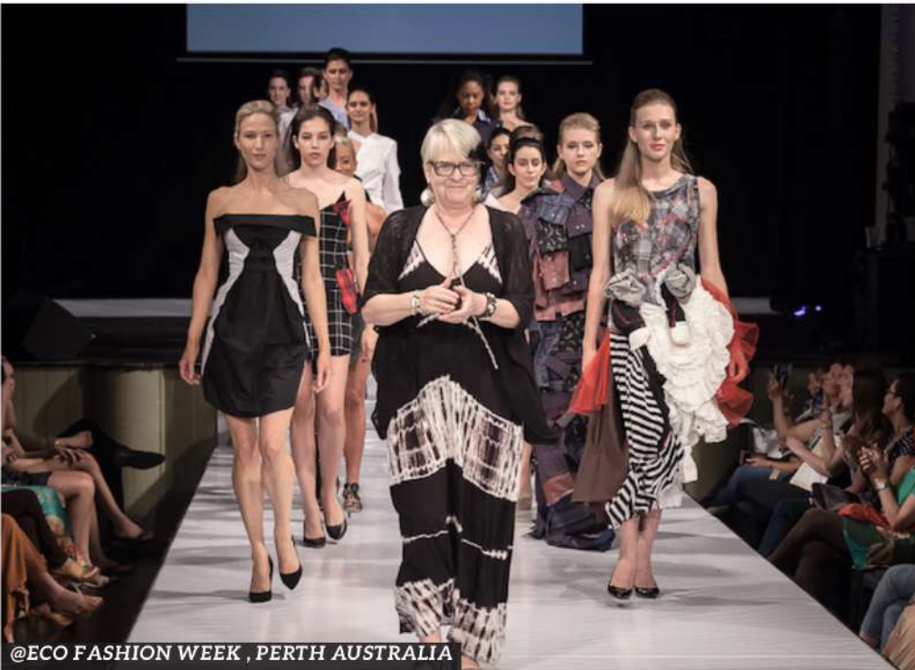
@ECO FASHION WEEK , PERTH AUSTRALIA