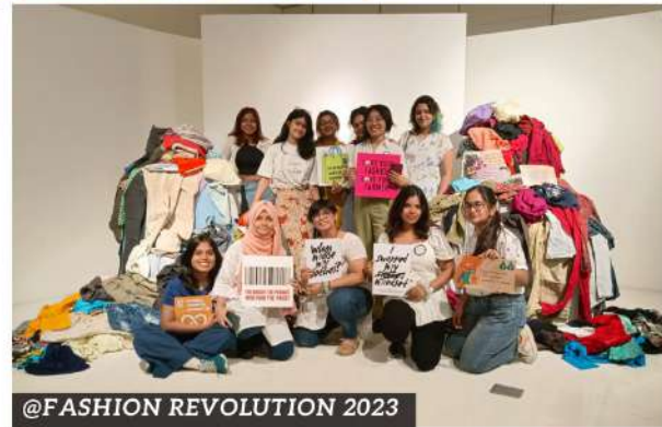
@FASHION REVOLUTION 2023