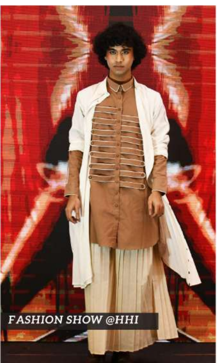
FASHION SHOW @HHI