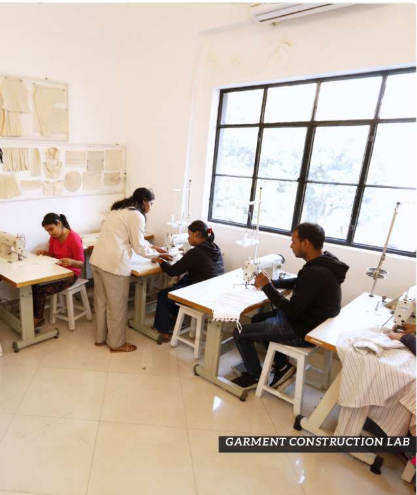
GARMENT CONSTRUCTION LAB