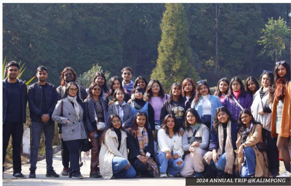
2024 ANNUAL TRIP @KALIMPONG