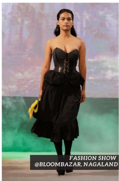
FASHION SHOW @BLOOMBAZAR, NAGALAND