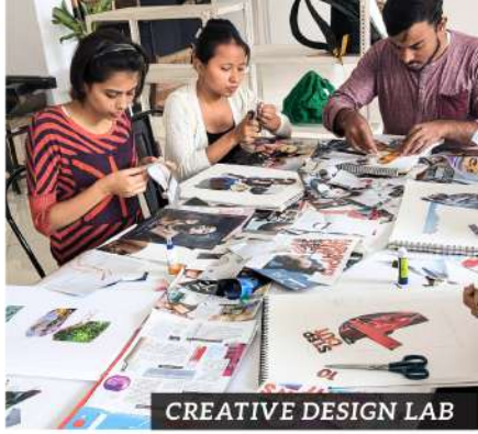
CREATIVE DESIGN LAB