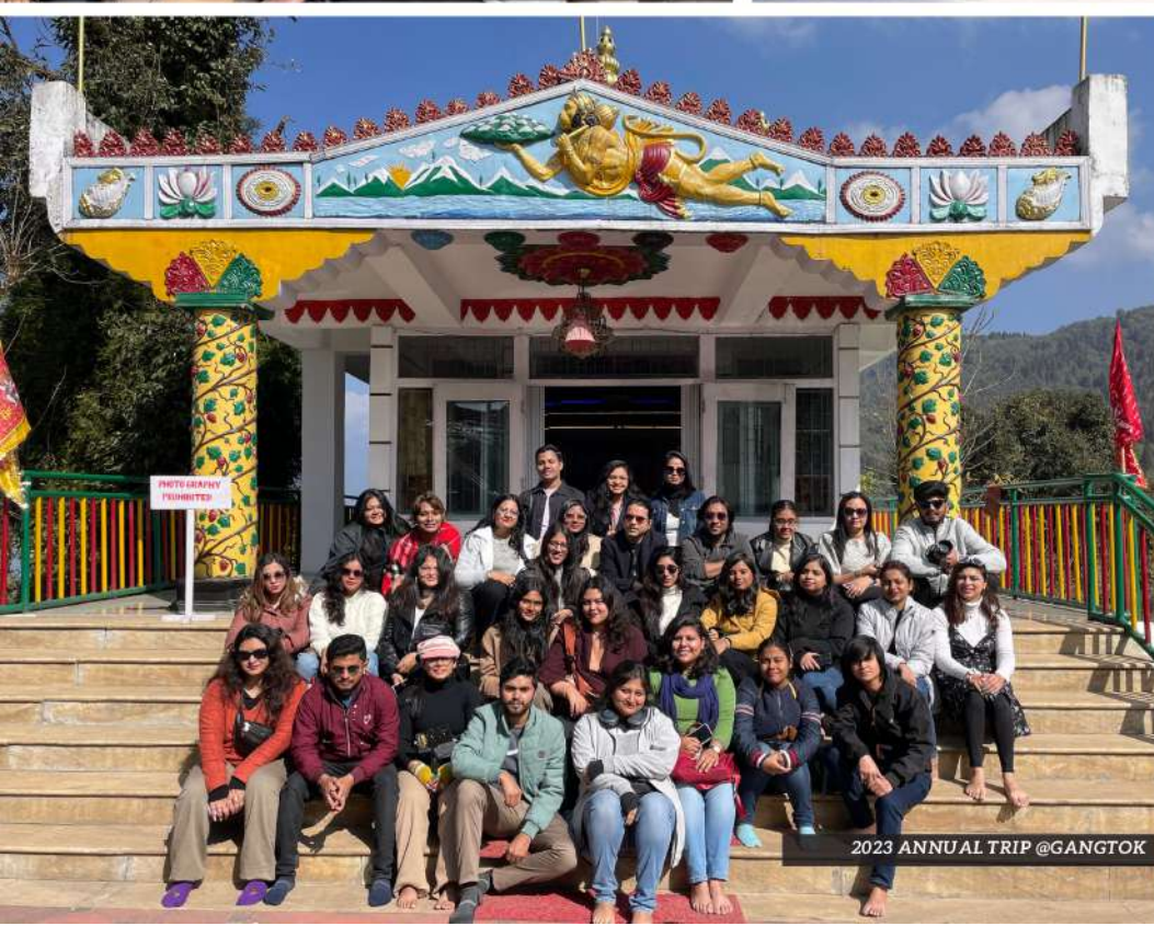
2023 ANNUAL TRIP @GANGTOK