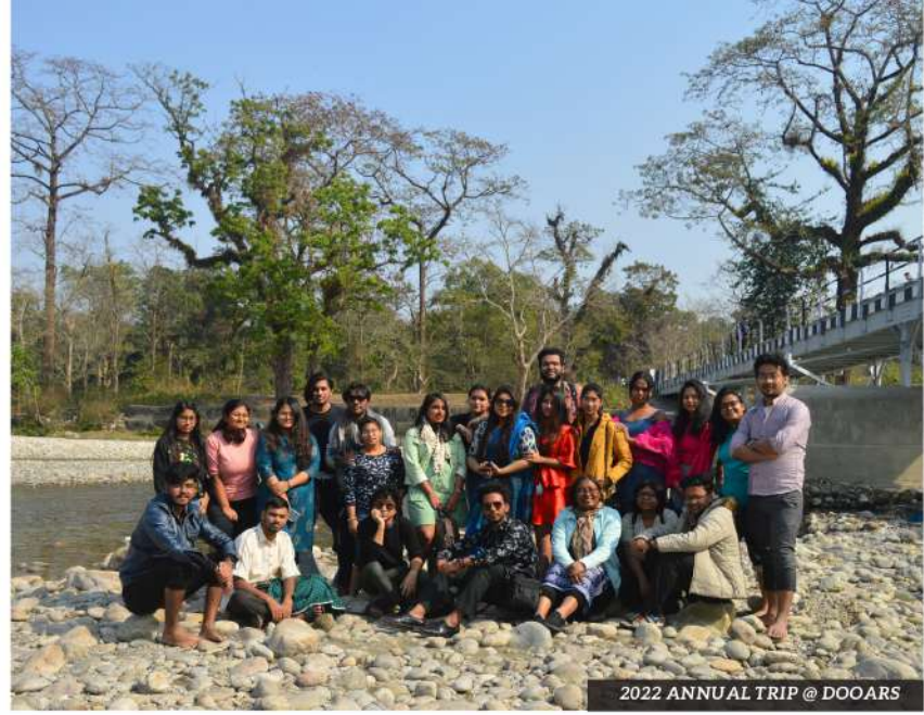
2022 ANNUAL TRIP @ DOOARS